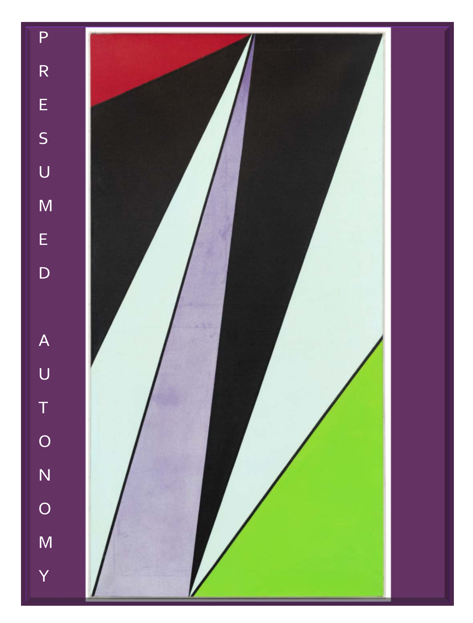
MAY 10–13, STOCKHOLM UNIVERSITY