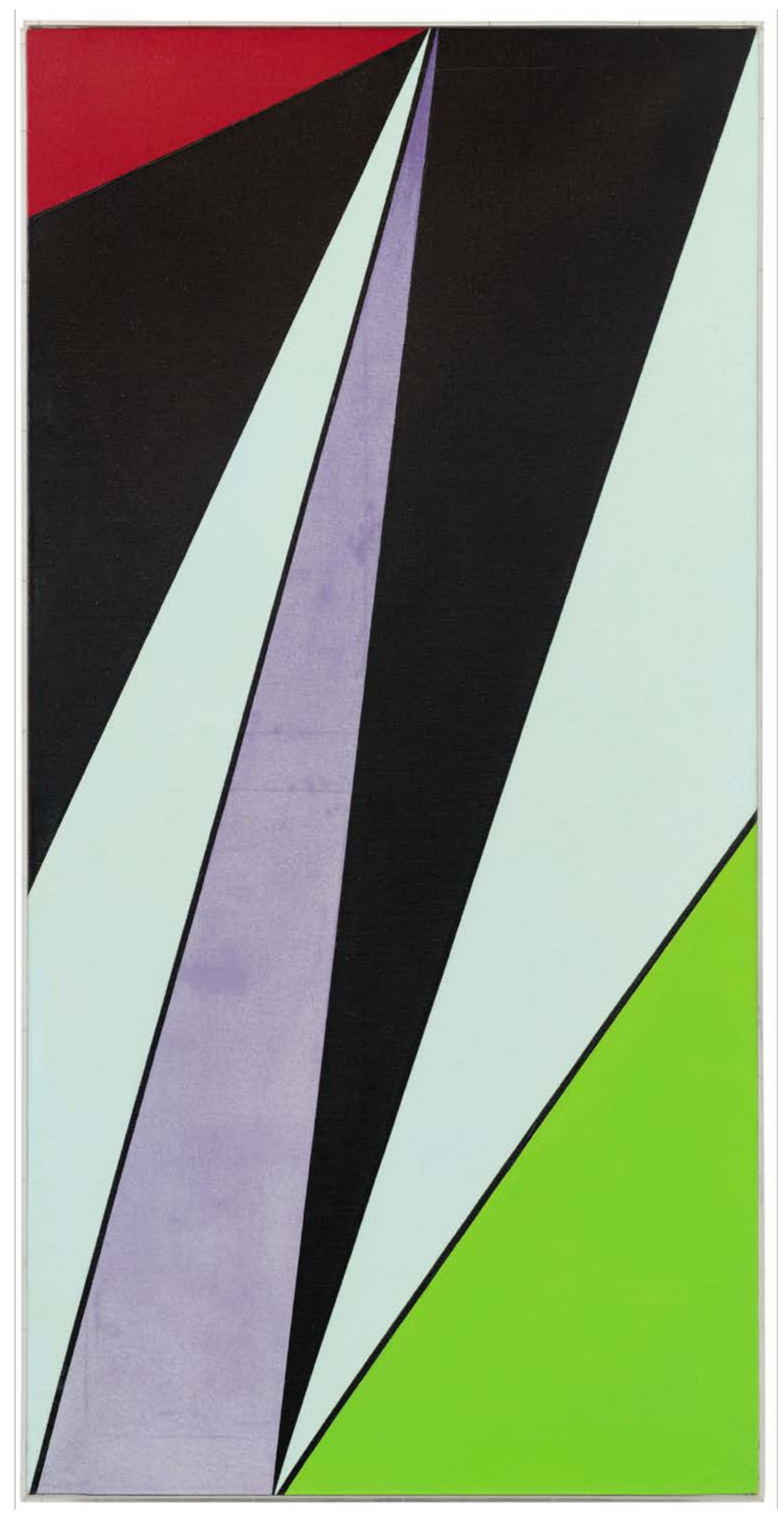
ARTIST: OLLE BÆRTLING, PHOTO: JEAN-BAPTISTE BÉRANGER